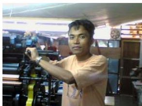
The press in operation!