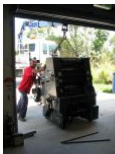
Peter guides it in...