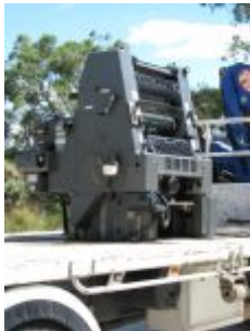
The GTO arrives at the print shop...