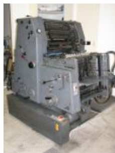
Finally in place!